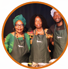
Culinary stations featuring African dishes by local chefs