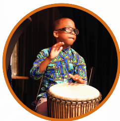
DJ set, cultural dance and storytelling