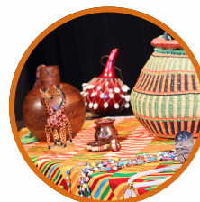
An AfriThrive Marketplace featuring African wellness and artisan vendors