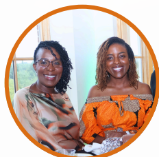
VIP cocktail hour for sponsors and special guests