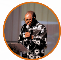
A fireside keynote conversation